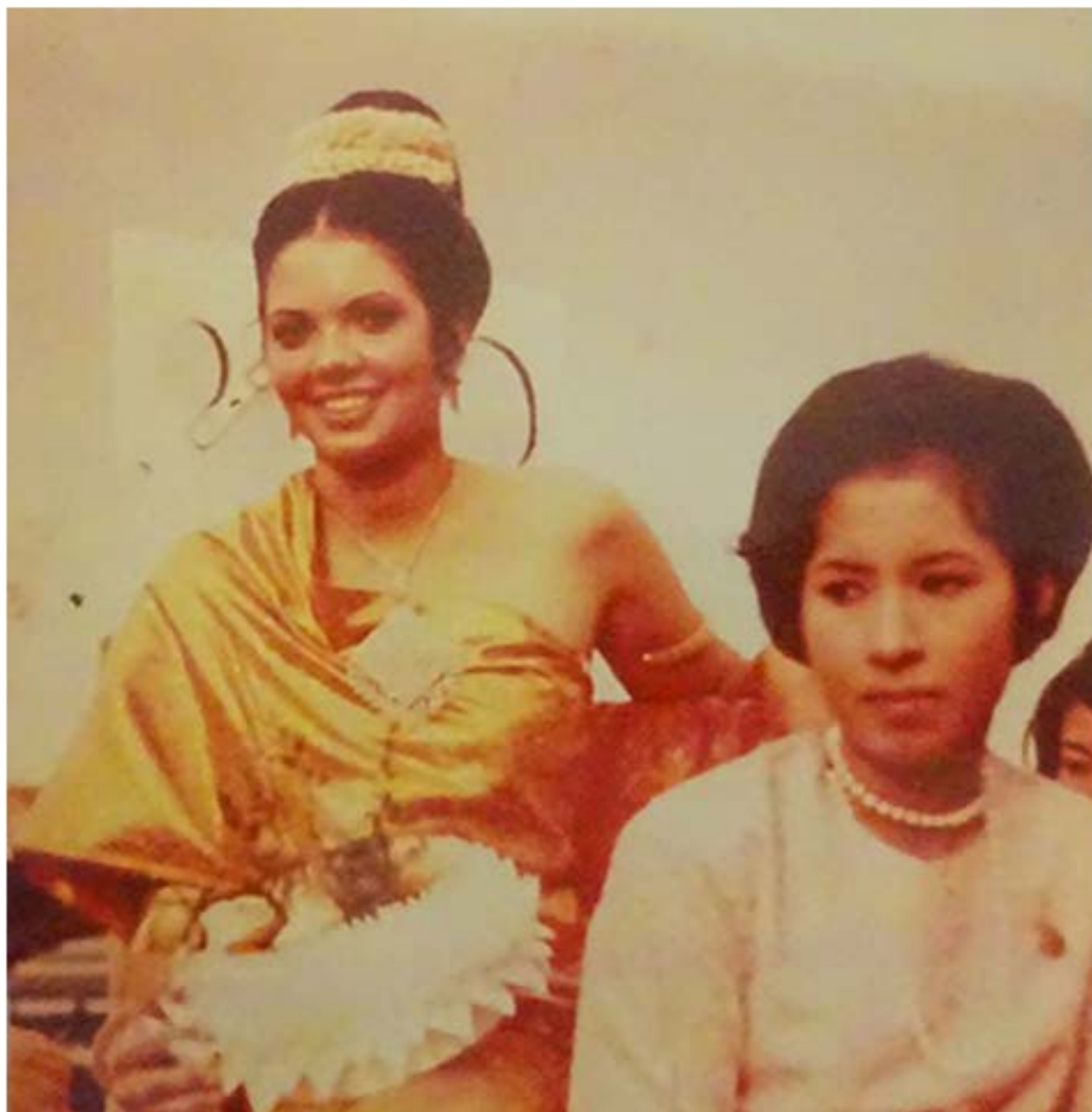
Saraburi: I was chosen to be the princess (or queen) of the local Loy Krathong Festival in 1971. I am wearing typical Ayudhya-style Thai clothing.