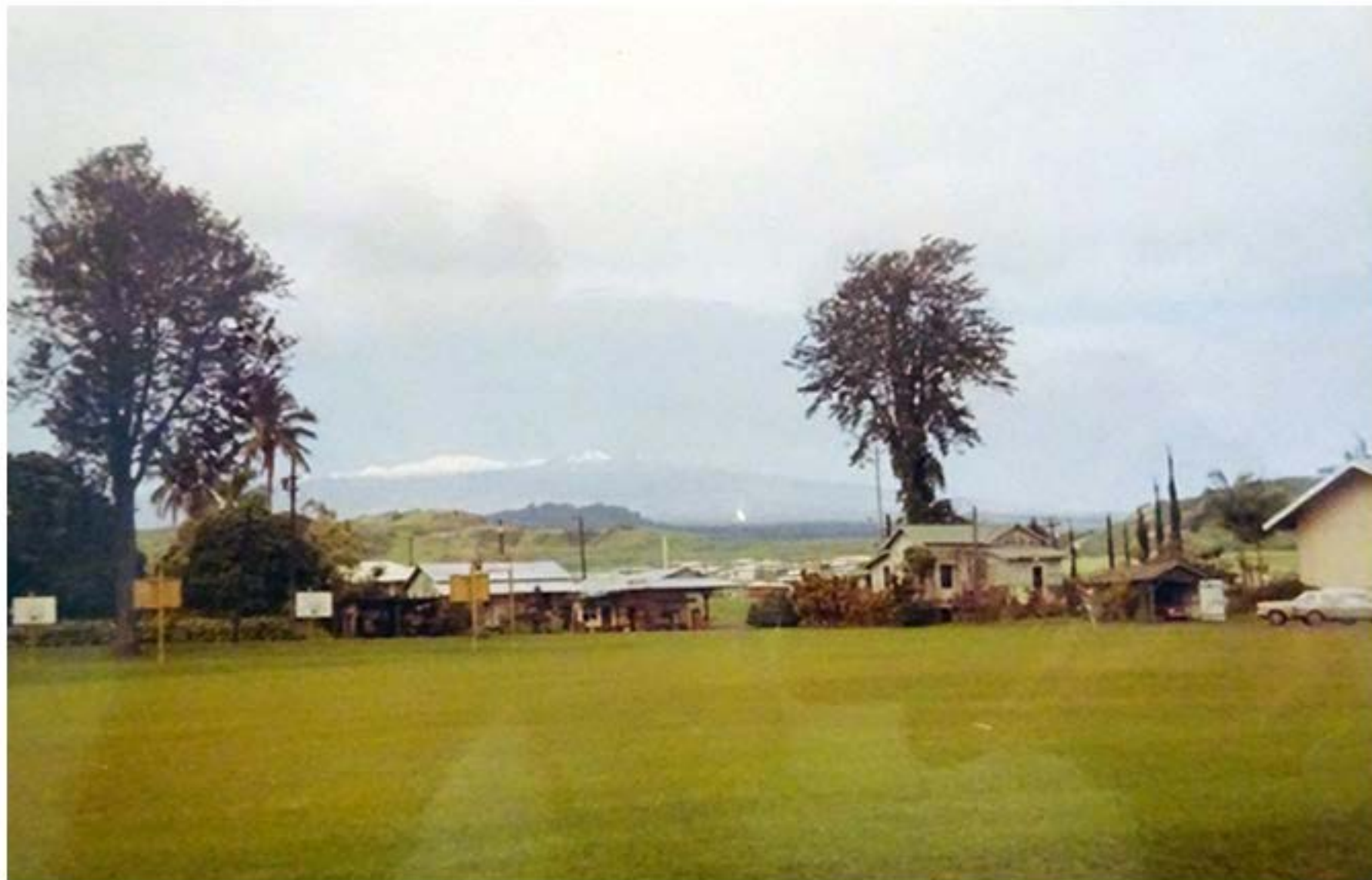
Pepe'ekeo: View from my classroom of Mauna Keo; has snow on peaks; April 1971