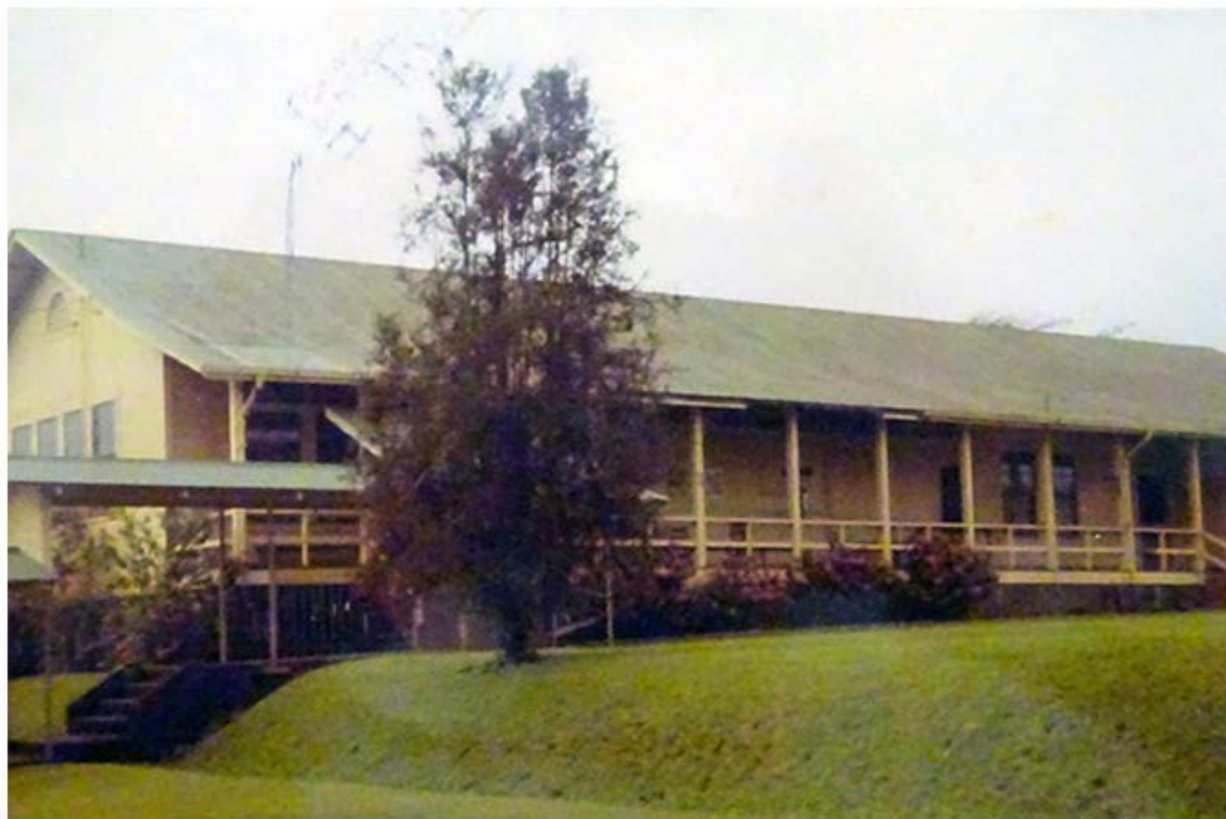
Pepe'ekeo: Army-like barracks where I spent the last six weeks sleeping; 4/15/71