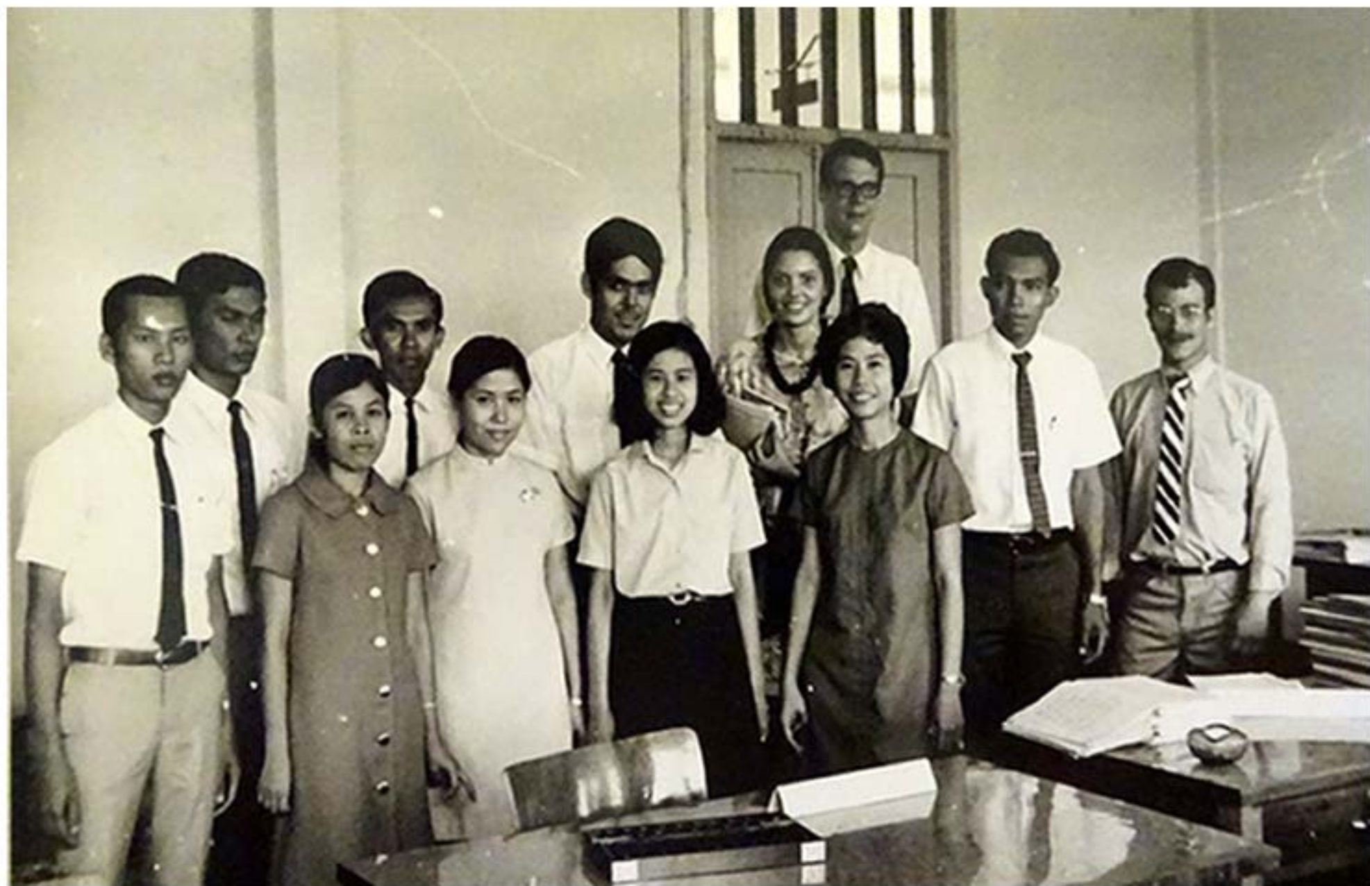
Thailand: The week before I was actually assigned to Saraburi - with two other trainees and one other volunteer - in my teachers' room to be.