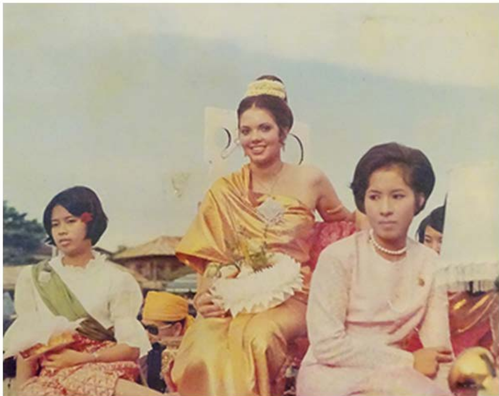
Saraburi: The Loy Krathong parade float.