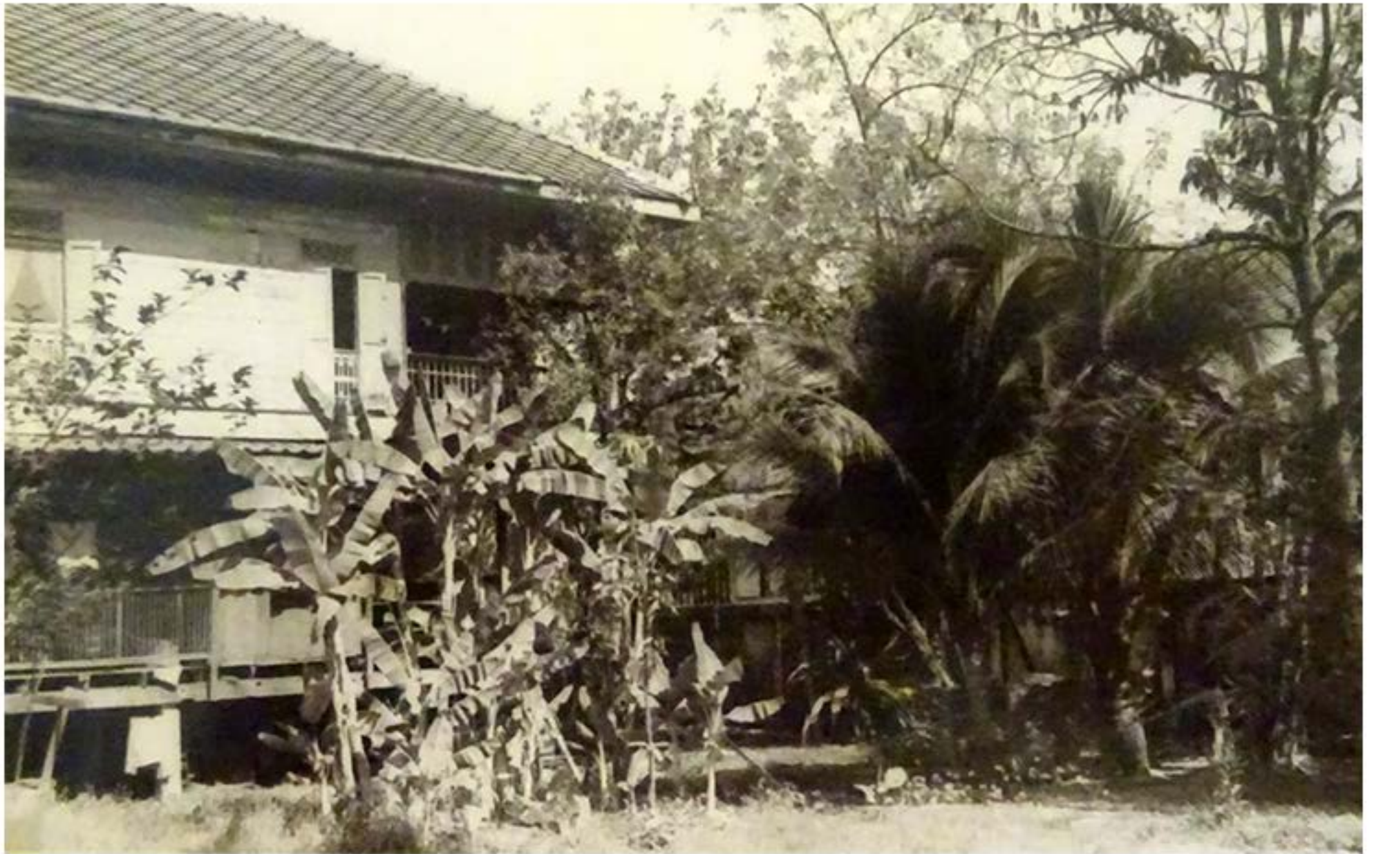
Half back view of my house in Bangkok. Notice the banana and palm trees.