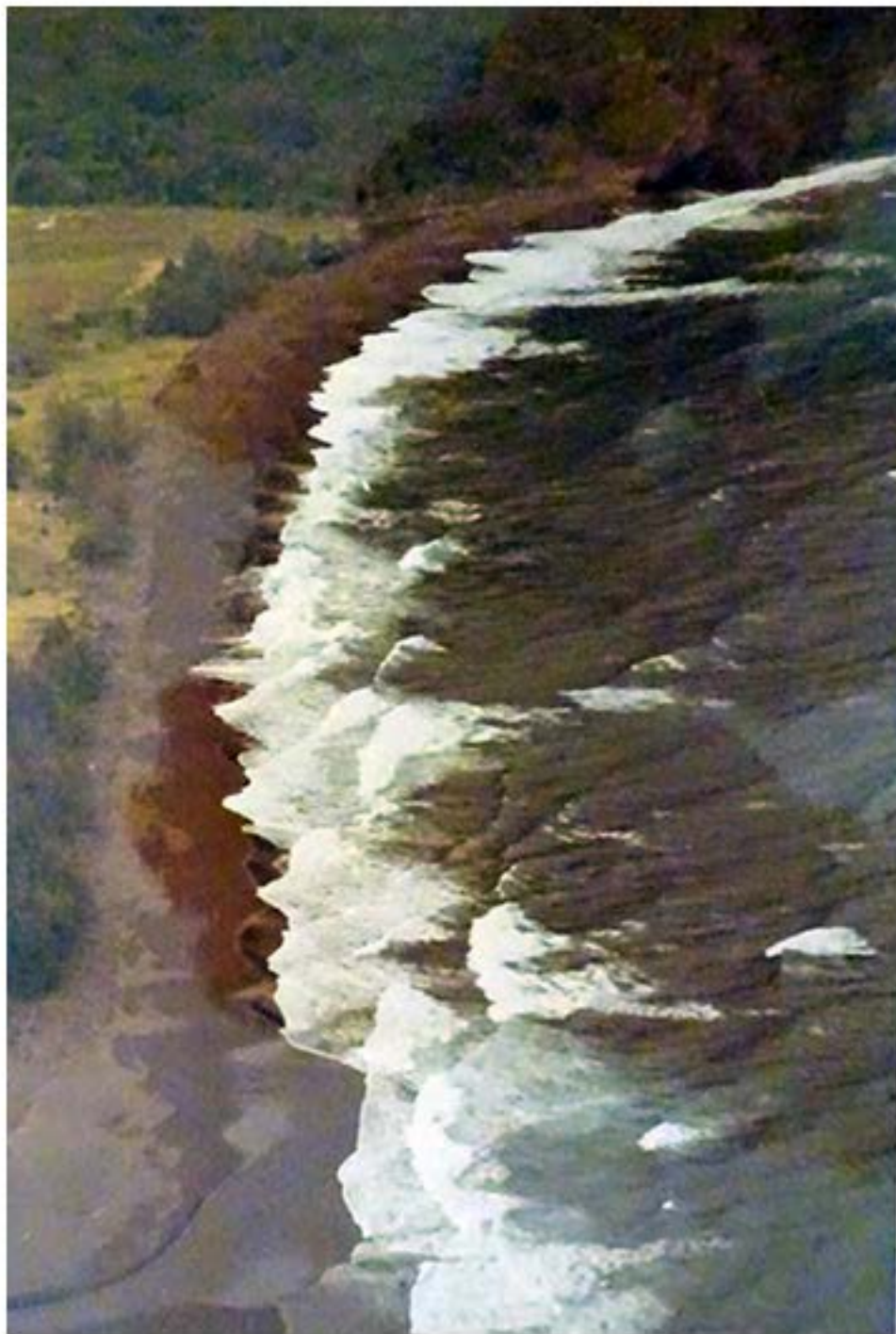
Beach Waipio Valley, gigantic mountains on 3 sides, 700 ft. waterfall you can't see; 4/15/71